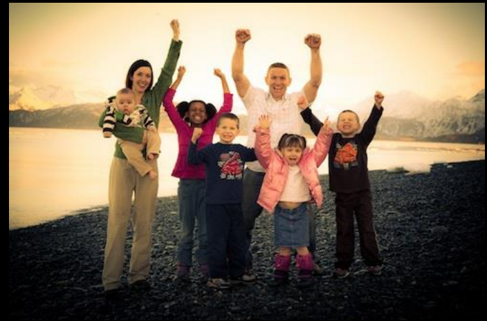
Google Images, 2018