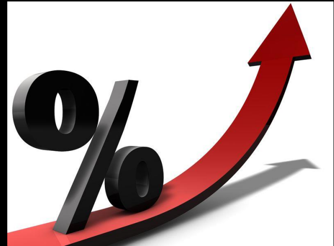
Google Images, 2018